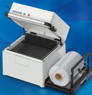
2 FILM ROLL POSITIONING