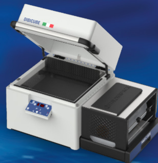
3 READY TO START