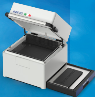
1 MAGIC BOX EXTRACTION

IT ALLOWS TO USE SHRINK GREEN FILM ® BY ITALDIBIPACK